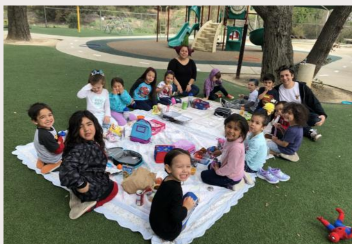
Pre-K children enjoying an activity outside

In celebrating Dr. Seuss birthday, March 4 th through the 7 th was spirit week for the San Pasqual Pre-K classroom. The children loved it as they were able to participate in crazy hair day, hat day, sports day, and wacky Wednesday.