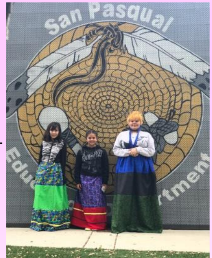
Participants show their creations

For Spring Break the San Pasqual Education Center provided material, sewing machines and irons for a traditional Bird Skirt sewing project for the San Pasqual Native youth. Students met at the San Pasqual Education Center on April 15-16, 2019 to make their very own Bird Skirt. The girls were given the opportunity to pick out their choice of fabric, measure and cut fabric to needed lengths, and sew the fabric together with sewing machines. Everyone worked together and created their own unique skirts. Most of the ladies who attended this event were first time bird skirt makers. It was a great time and the energy in the room was gratifying. This project was in collaboration with the Native Women's Resource Center and the San Pasqual Housing & Community Development who provided the funds for purchasing the materials. This was an opportunity to introduce domestic violence and teen dating violence awareness to the young girls that participated. There were approximately twenty (20) participants. For more information on educational services please call Lorraine Orosco, Director or Deana Martinez, Program Manager: (760) 751-1474.