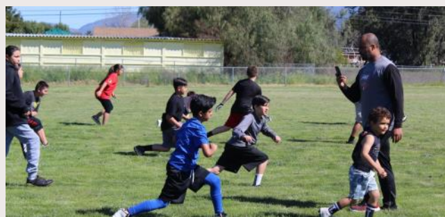
Flag Football Training Camp