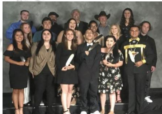
San Pasqual 2019 graduates